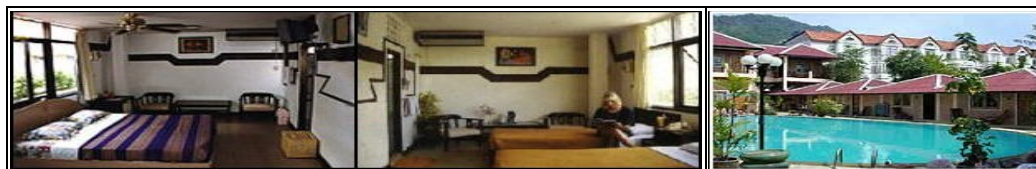
Kata Center Inn and Little Mermaid GH & Bungalows

Pick your own accommodation just 1-2 minutes walk to your IDC classroom at Calypso Dive Center. Price per room with a queen size bed, your own bathroom and shower, daily towel change and room cleaning (fan or aircon), per week starts from 1,800 THB (that's about 45.00 $US). Your hotel is just 1-2 minutes walk from your IDC classroom, restaurants, pharmacy, medical center, cafe, night market, and 5 minutes walk to beautiful Kata Beach! Just let us know your preference, single or double? We'll be happy to assist.