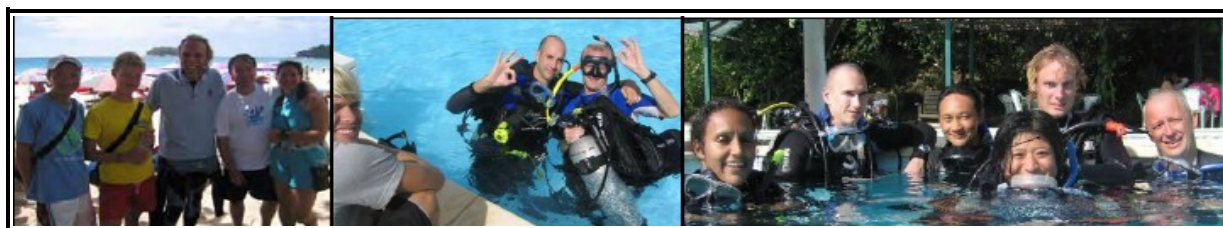
(L to R): 2006 – February, April, and January Successful IDC candidates

Early Online booking Bonus: 2 weeks free Single Accommodation for those who plan and book early with our Complete GoPro Package! All you need to do is pay your deposit (350.00 $US) online or via bank transfer, and we'll take care of your accommodation for 2 weeks. Your own room will have a queen size bed, your own bathroom and shower, daily room cleaning service, fan cooling or aircon (depending on availability), and within 2-3 minutes walk to your IDC classroom.